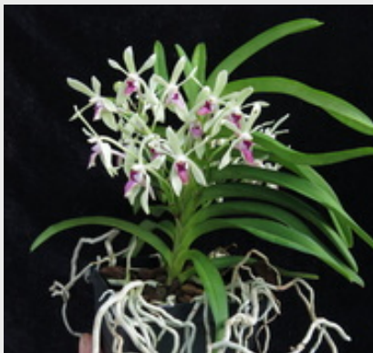
Vandofinetia Virgil 'Pale Jade'