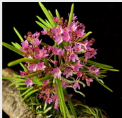
Ascozentrum pumilum "Diamond Orchids"

and starting a career. It wasn't until about 14 years ago that the orchid "bug" came back and he is now heavily involved once again. He is an accredited judge with the American Orchid Society and a hybridizer of mini-catts. He enjoys meeting with other orchid enthusiasts, and can often be found at various orchid shows and societies around the country. He also has thousands of photos of his orchids that he maintains on Flickr .