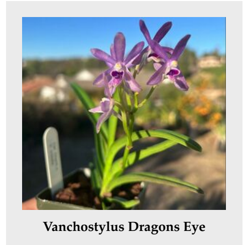
Vanchostylus Dragons Eye

Peter started growing orchids over 30 years ago, but then stopped due to school